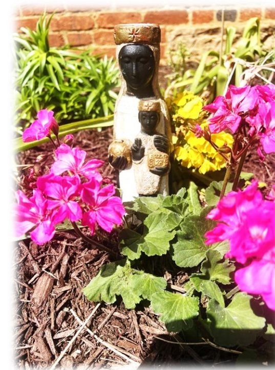
May is Mary's Month: Our Lady of Monsterrate-Pray for us!